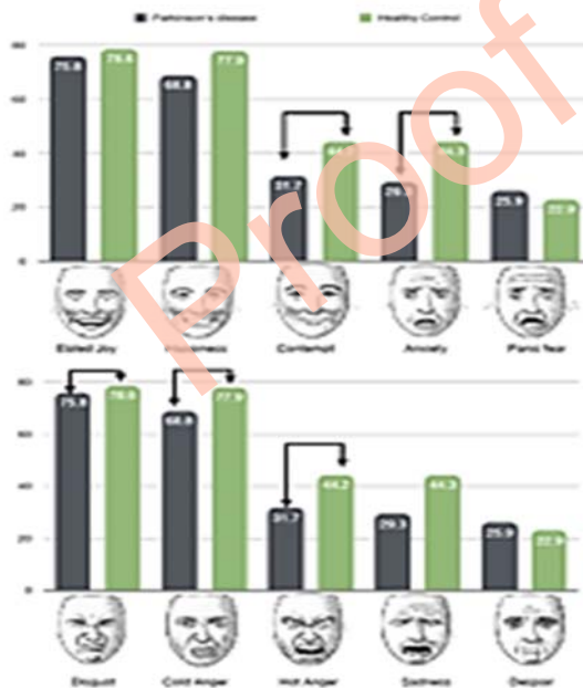
Figure 2. The Multimodal Emotion Recognition Test (MERT) score (percentage of correct answers) in patients with Parkinson's disease (PD) and healthy controls (HCs) based on different emotions. Arrows show statistically significant differences.

As shown in figure 2, patients with PD had significantly lower score in recognizing contempt (31.7% vs. 44.2%), anxiety (29.3% vs. 44.3%), disgust (25.8% vs. 28.6%), cold anger (26.8% vs. 44.2%), and hot anger (31.7% vs. 44.2%) ( P < 0.05 ).